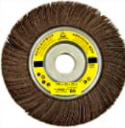
SM 611 W