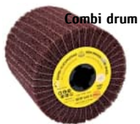
NCW 600 S