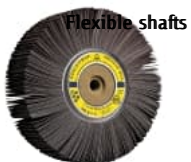
SM 611 H