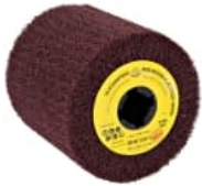
NFW 600 S