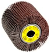
SM 611 S